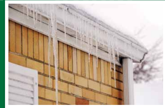
ICICLES AND ICE DAMS